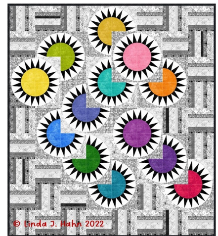
This is the "without border" version/one color spires/multi color pies